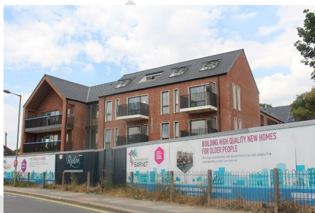
Ansell Court under construction

Barnet Homes is currently building a new 53-unit extra care scheme at Ansell Court (formerly Moreton Close NW7), which will be completed during 2018. This scheme has been designed with a focus on the needs of people living with dementia to meet the growing need for these services. Sites for two more extra care schemes have been identified and construction on these is expected to start in 2019, providing a further 125 properties.