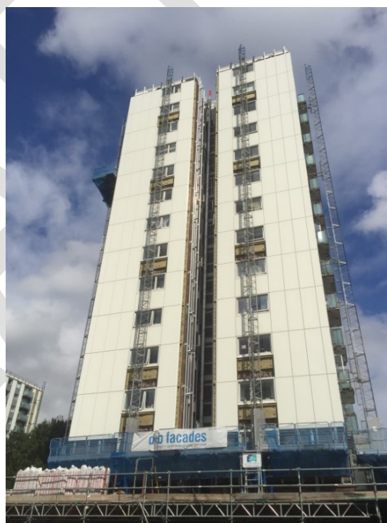
Cladding replacement works underway at Granville Road

Three blocks at Granville Road were identified as having been clad with Aluminium Composite Panels, which failed government fire safety tests. The council moved quickly to remove these panels and a non-combustible replacement cladding has now been fitted.